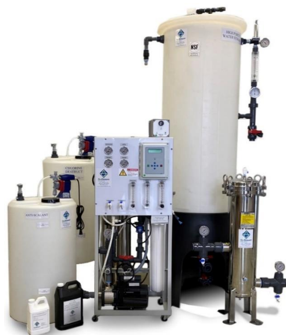
Complete System for Models SP45, SP90 and SP135 Shown